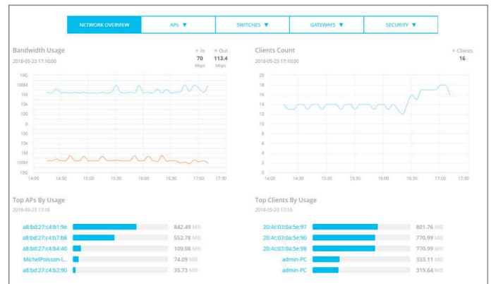
Figure 1: Health and Usage Monitoring