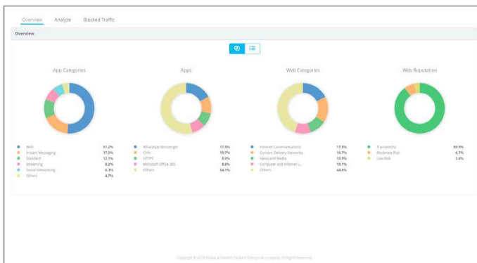
Figure 3: Application Visibility and Control

This integrated intelligence provides you the insight to prioritize business critical applications, limit the use of inappropriate content and set and enforce access policies on a per user, device or location basis.